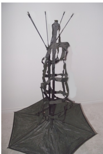
Pull helical up mast and snap it to arms