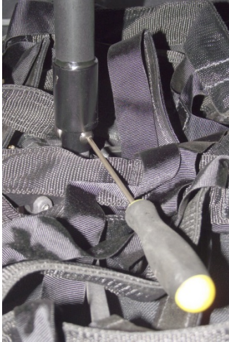
Using supplied Allen key remove all 3 screws from base of mast.

Please Note: A qualified structural engineer should be consulted prior to mounting an antenna on a tower or support structure.