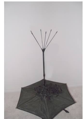
Extend mast past push button so it is locked in place