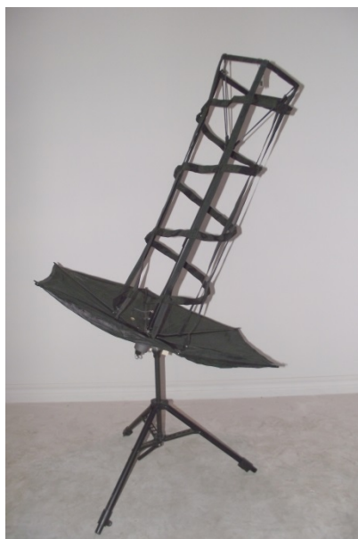
Start with antenna in deployed position