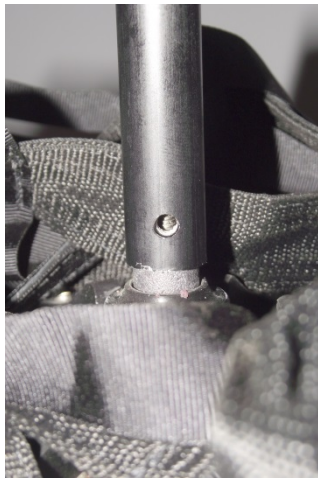
Slide Mast assembly onto antenna and align holes, ensure mast is inserted through center of helical