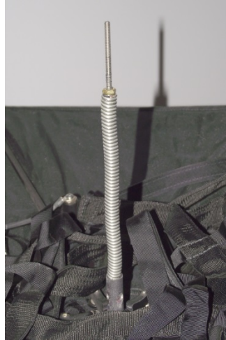
Pull mast off antenna assembly