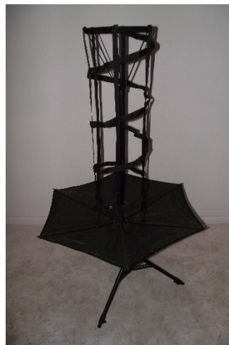
Moving around antenna snap the rest of the helical to the arms, ensuring that the vertical straps are going straight up