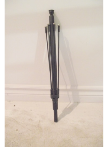
Take supplied mast assembly