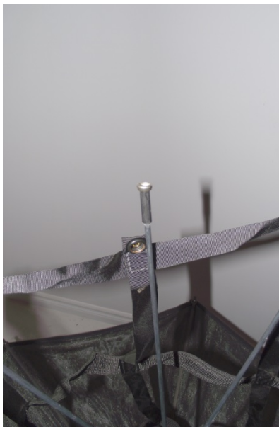
Unsnap helical from mast