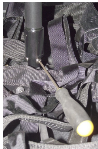
Using the 3 supplied screws and lock washers screw mast to antenna