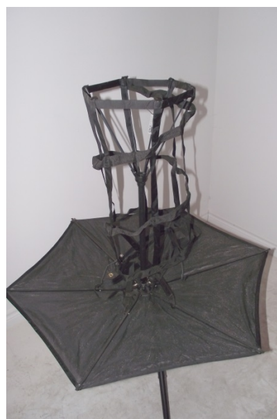
Lower mast to remove tension