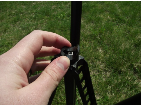
Place new lock bearing onto tripod with link rod in the slot.