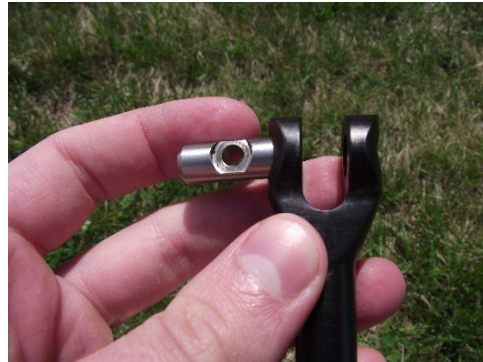
Slide new lock pin into new handle