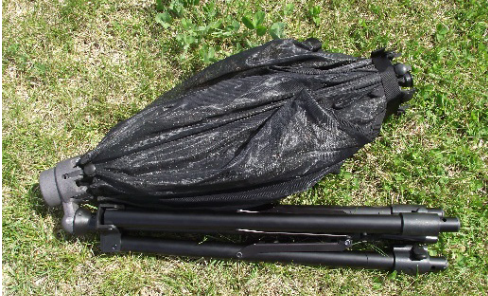
Start with antenna in folded position