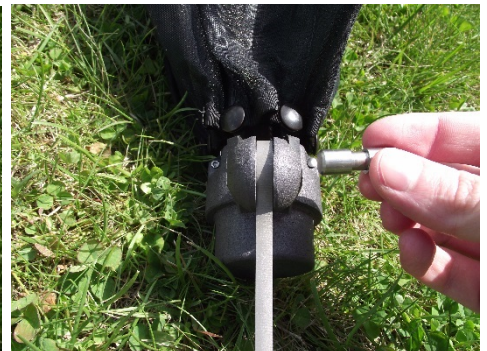
Remove pivot pin