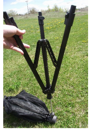
Slide new tripod on link rod