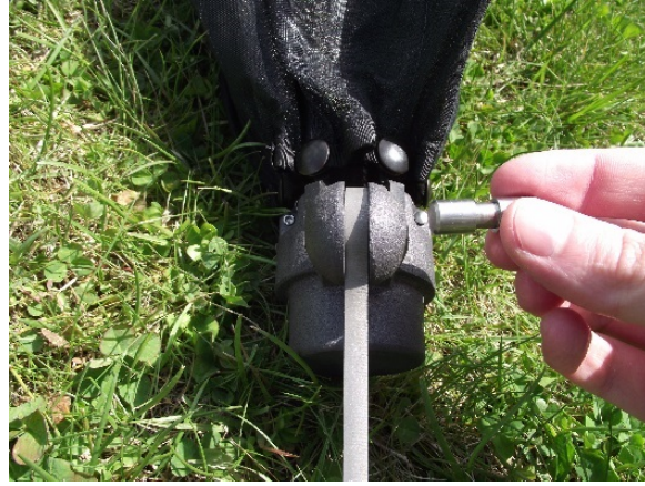
Insert new link rod and pivot pin