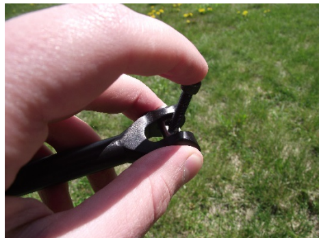
Insert new screw into lock pin