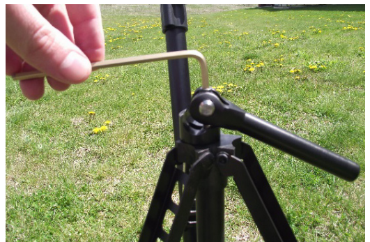
Screw into link rod to desired tightness. How tight it is will affect how easy or hard it is to lock the tripod with the handle.