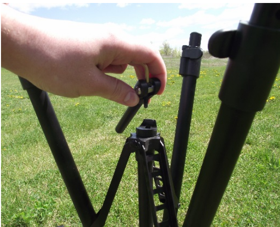
Remove, screw, handle, and pivot pin