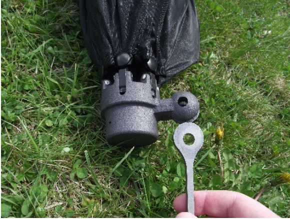
Remove link rod