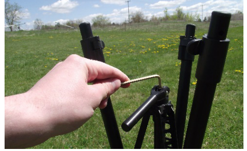
Using supplied allen key remove screw