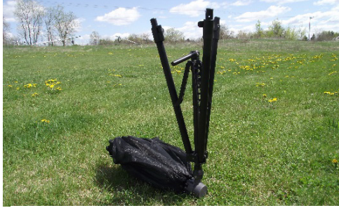
Spread Tripod Legs