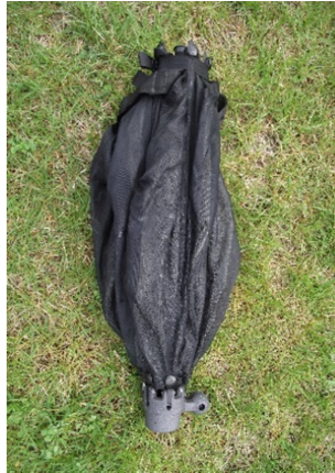
Take new screen assembly