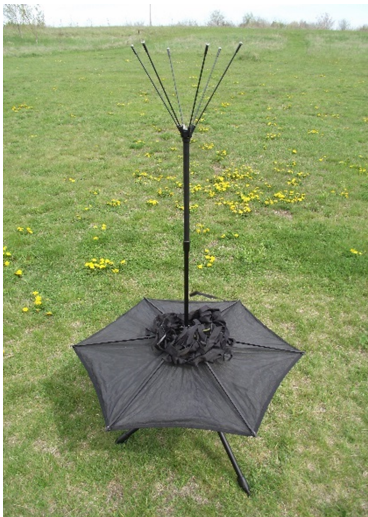
Extend mast past push button so it is locked in place