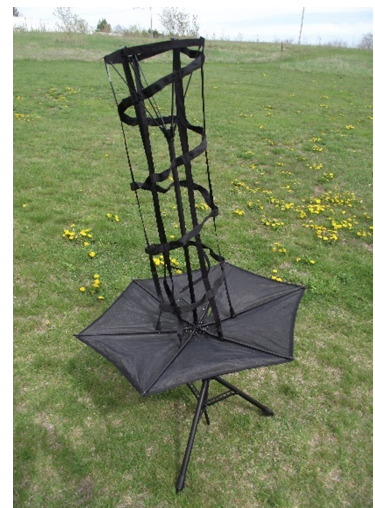
Moving around antenna snap the rest of the helical to the arms, ensuring that the vertical straps are going straight up