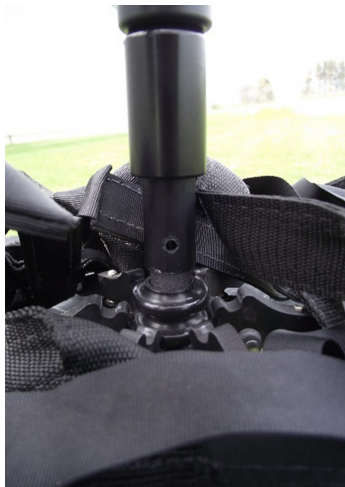
Slide Mast assembly onto antenna and align holes, ensure mast is inserted through center of fabric helical