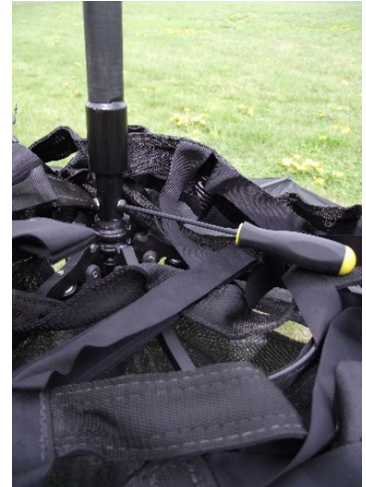
Using the 3 supplied screws and lock washers screw mast to antenna.