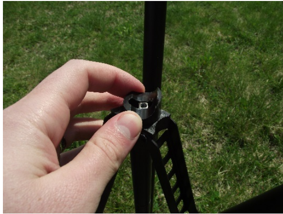
Place lock bearing onto tripod with link rod in the slot.