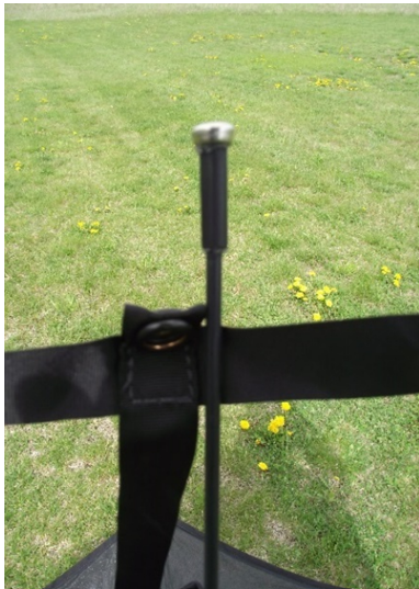
Unsnap helical from mast