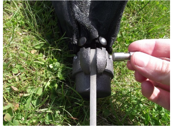
Fasten it to the link rod removed in the previous step using pivot pin