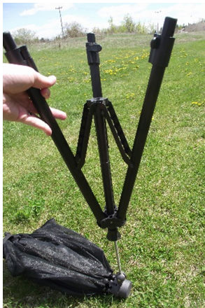
Slide tripod onto link rod