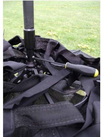
Using supplied Allen key remove all 3 screws from base of mast.