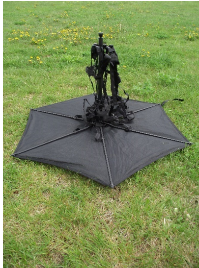
Open old antenna

Screw into link rod to desired tightness. How tight it is will affect how easy or hard it is to lock the tripod with the handle.