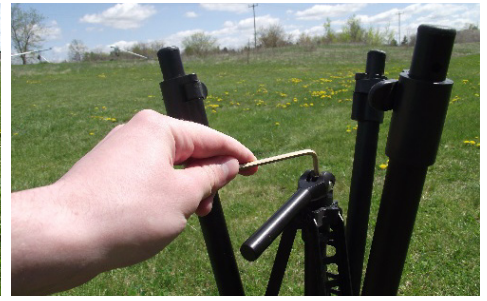
Using supplied allen key remove screw