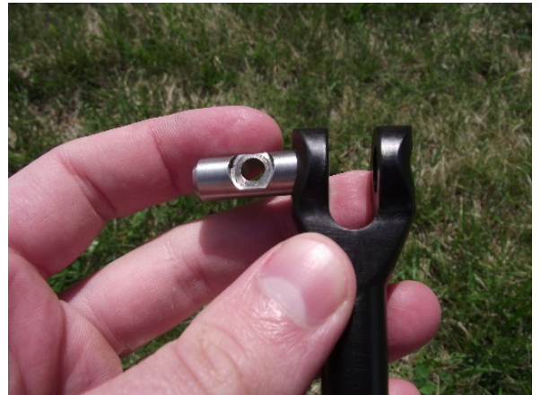
Slide lock pin into handle