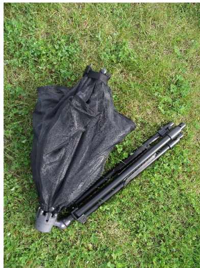
Take newly assembled screen and tripod