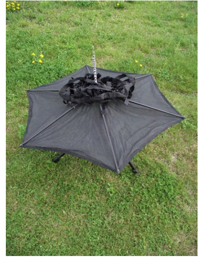
Setup tripod and open screen