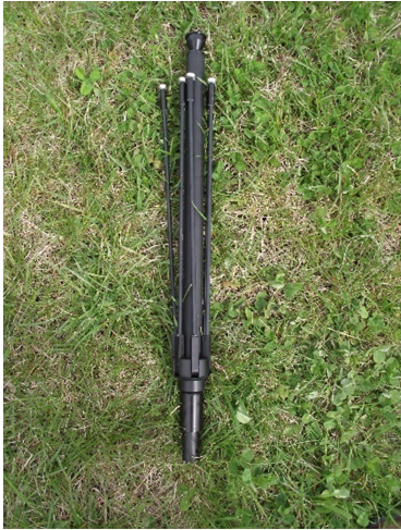
Take mast assembly removed in prior step