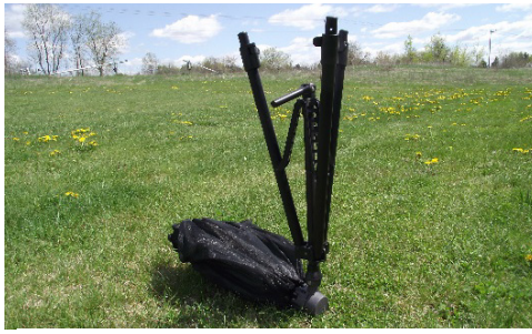
Spread Tripod Legs