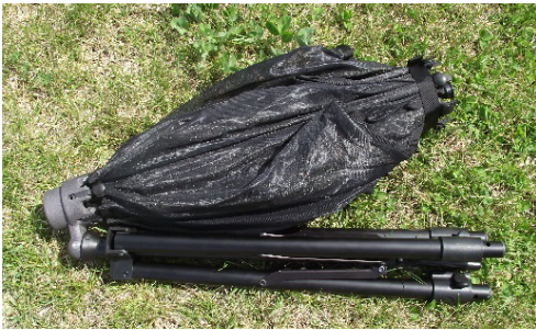
Start with antenna in folded position