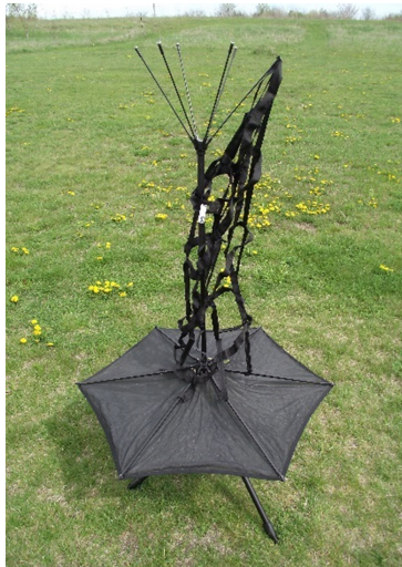
Pull helical up mast and snap it to arms