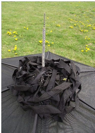
Pull mast off antenna assembly