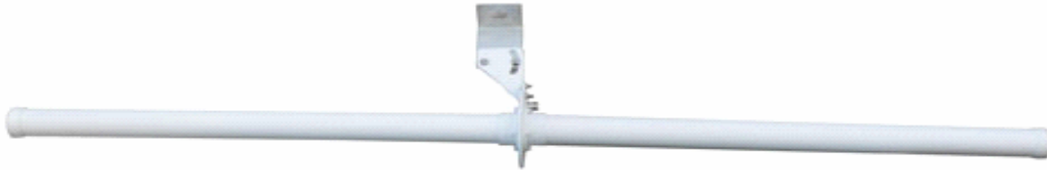
BDH2024 Model Shown