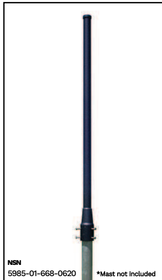
NSN 5985-01-668-0620 *Mast not included