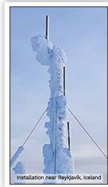
Installation near Reykjavik, Iceland